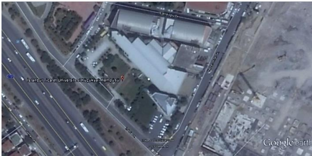
Fig. 1: Google Earth image