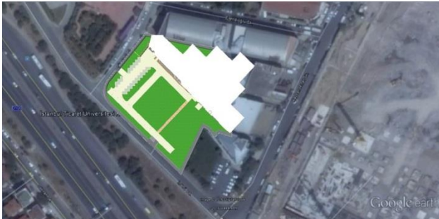
Fig. 2: The model created using Google Earth