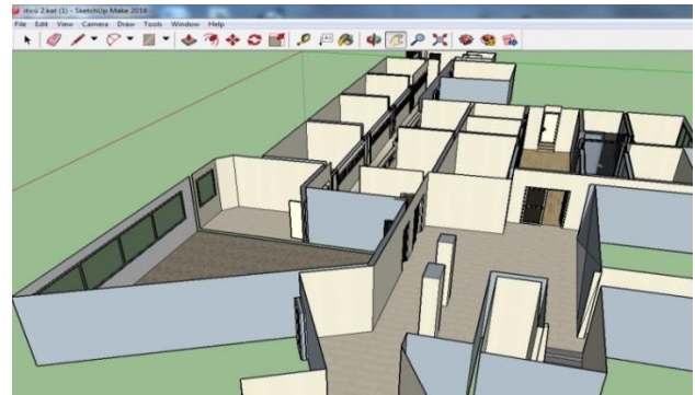
Fig. 4: Second floor model (computer engineering department)

In order for the VR experience to work properly, multiple technologies and techniques come together to form a whole. In general, it can be examined in two areas, as 3D imaging and head-mounted monitoring.