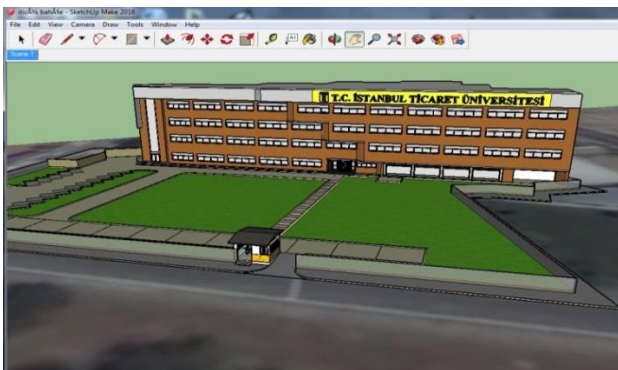
Fig. 3: Garden view of university