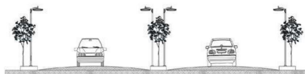
Fig.3: A section View for Shuhada Road [19]

Shuhada Road is a main two directional road; as shown in figure 3. Each direction has four lanes with a total width of 10m. There is a pedestrian sidewalk on the right side of each direction with a total 1 meter width and 20 cm height. Moreover, there is a landscape strips that cuts the street into two directions with 1m width and 20cm height as shown in figure 3.