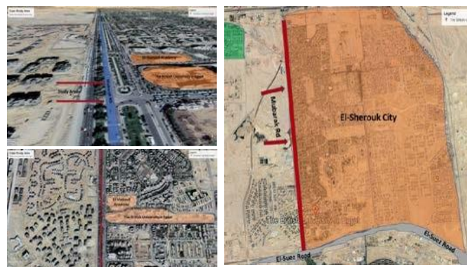
Fig.2: The location of Shuhada Road [16].

The study area of this research is Shuhada Road. This road used to be called Mubarak road which was named attributed to President Mubarak, the name of the road has been change to Shuhada Road after the Egyptian revolution in June 2013 which means Martyrs. Shuhada Road located in El-Sherouk city, Cairo-Egypt. Shuhada Road has been chosen to be the study area of this research due to the availability of data and because it is a crowded road that links Ismailia-Cairo desert road with Sues-Cairo desert road, Shuhada Road is considered the main road in El-Sherouk city, knowing that El-Sherouk city is one of the most crowded new suburbs in Cairo, it includes many public facilities, the most important facilities in this suburb is the two private high educational facilities which are “the British university in Egypt (BUE)” and “El-Sherouk Academy” and both of them are located on Shuhada Road as shown in figure 2.