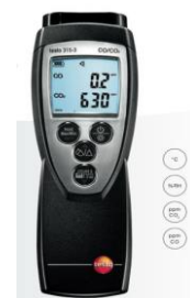
Fig.4. Testo 315-3

The Activity of vehicle will be measured by electrochemical sensor for CO measurement and a shock-resistant infrared CO 2 sensor. The instrument used (testo 315-3) is equipped to resist external influences by its robust design and the optionally available TopSafe, device is shown in figure 4. During the measurement, optical and audible signals shows immediately whether the variably adjustable limit values have been exceeded.