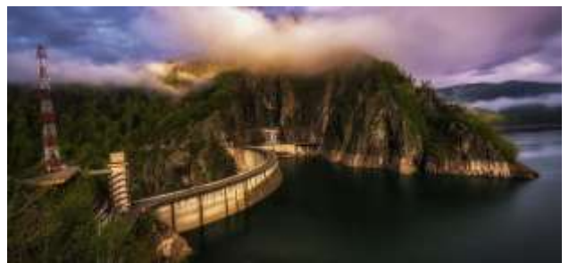
Fig. 1: Top view of Vidraru Dam

The Vidraru Dam has a 166.6 m height, an up-side of the dam (canopy) of 307 m and a thickness of the up side of the dam (canopy) of 6 meters. The arch of the dam includes 22 vertical columns joined by expansion joints, and each column is divided into 2 m high slats. For the construction, 480 000 cubic meters of unarmed, waterproof concrete, the B600 brand, were required The body of the dam is located inside the slopes of the Plesa and Vidraru mountains, being crossed by 9 horizontal galleries from which the integrity of the dam is controlled and measured. The communication between the galleries is made either with the two interior elevators or on the exterior access routes. The Vidraru Dam falls under the "A" category of exceptional importance, and at the time of its inauguration, it was the fifth in Europe and the ninth in the world between similar constructions, [2].