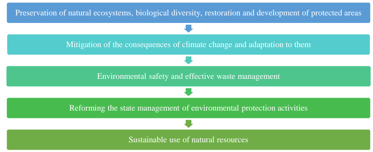
Fig. 4: Priority areas of post-war environmental restoration of Ukraine

Ukraine became the site of hostilities. Bombing, trenching, and tunneling have a negative impact on chernozem. In July 2022, in Ukraine, the National Council for the Recovery of Ukraine from the Consequences of War developed the Draft Plan for the Recovery of Ukraine, [26]. Accordingly, five priority directions were determined (Figure 4).