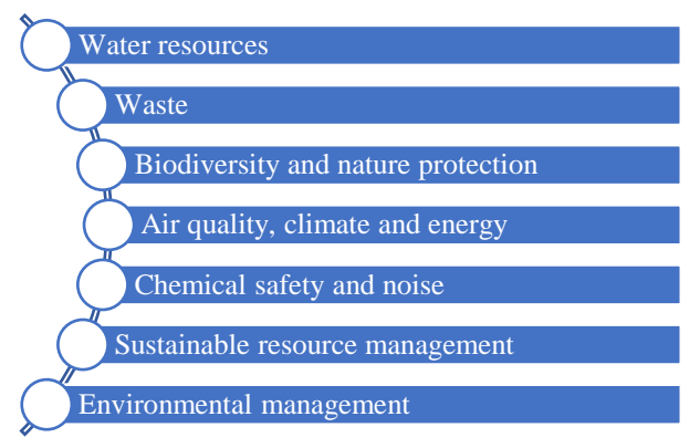
Fig. 3: The main areas of EU environmental policy in accordance with the sustainable development goals

The above-mentioned document will clearly define actions achieve environmental sustainability and improve the health of citizens, unification of the country's administrative units for environmental protection. The adoption of the Federal Environmental Strategy by the government of the Federation of Bosnia and Herzegovina on August 25, 2022, was a positive point. The Environmental Strategy of the Brčko District for 2022-2032 was adopted on November 2, 2022, and the Environmental Strategy of the Republic of Srpska was adopted on November 17, 2022. The film BiH ESAP 2030+ was created to popularize this environmental initiative in Bosnia and Herzegovina. This film is shown to students, followed by a productive discussion environmental experts. To move to the next stage of formal EU accession negotiations, Bosnia and Herzegovina must make progress on many of the reform priorities set out by the European Commission.