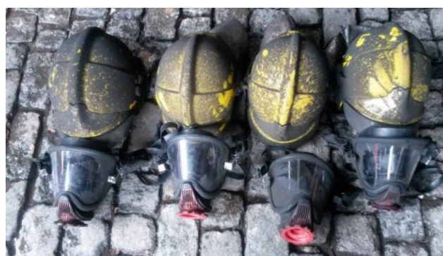
Fig. 2 Firefighters' helmets after fire is extinguished.