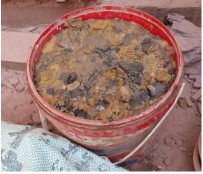
Fig. 2. Fermentation of soil

The soil required for the sampling was collected from one of the brick manufacturing factories located at Al-Tibin district on the industrial outskirts of the city of Helwan. According to the workers of the factory the soil had (1:3) sand to clay ratio, and they instructed that the dry soil is to be fermented by adding a small amount of water for 2 days in order that the soil will be ready for use as shown in Fig. 2.