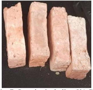
Fig. 7. Samples including 5% CB

The bricks emerged with the desired red surface colour indicating that they were fired thoroughly. However, during the testing stage a more technical perspective suggested that the bricks may have been over burned in the kiln. It is apparent through viewing figures that there is a stark visual difference between samples having 5% Cigarette butts'(CB) volume as shown in Fig. 4. Fig. 7 and samples having 10% Cigarette butts' volume as shown in Fig. 4Fig. 8 and the difference is the amount of surface cracks in the bricks.