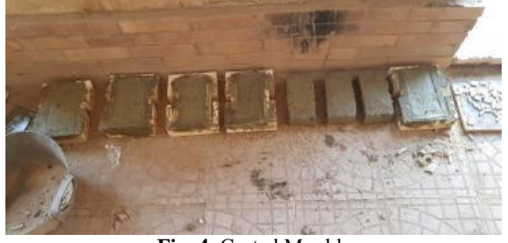
Fig. 4. Casted Moulds

Moulds used were wooden with the following size 20cm x 10cm x 6cm (length x width x height) respectively as shown in Fig. 4. Compaction is then undergone using a vibration sander by steadily moving it along the exterior perimeter of the moulds causing consistent vibrations, thus compaction occurs and allows for air bubbles to appear as it eliminated air gaps within the mould.