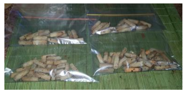
Fig. 1. Post-oven heating, sealed cigarette filters

A neighboring coffee-shop having smoking-oriented customers was asked to provide the used cigarette filters instead of disposing them in the garbage. The filters were then collected and soaked in cold water to ease the removal of the plug wrap paper and the tipping paper while cleaning it from any un-smoked tobacco and wrapping paper leaving only the filter itself. Filters were then put into the oven at a 100 degrees Celsius for 24 hours to thoroughly be disinfected. Upon removal from the oven they were then sealed in plastic bags as shown in fFig. 1.