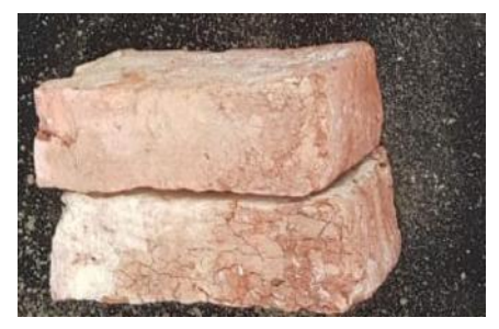
Fig. 8. Samples including 10% CB