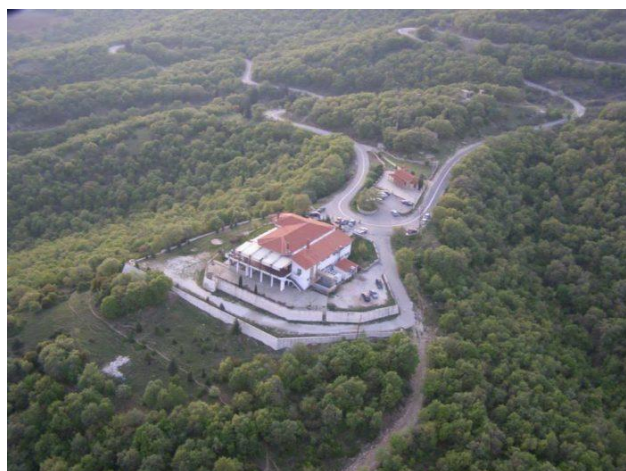
Fig. 2. Nimfaia Urban Forest and its Tourist Kiosk