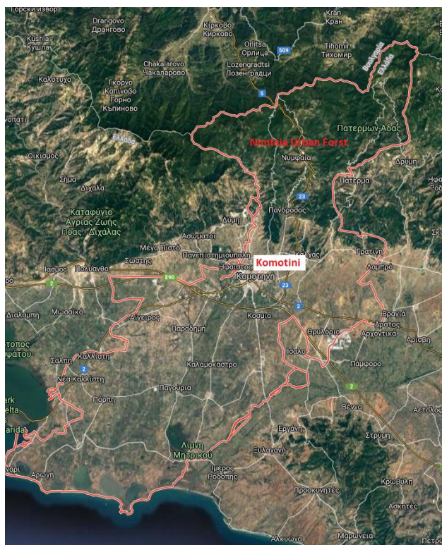
Fig. 1. The map of the Municipality of Komotini and Nimfaia Urban Forest