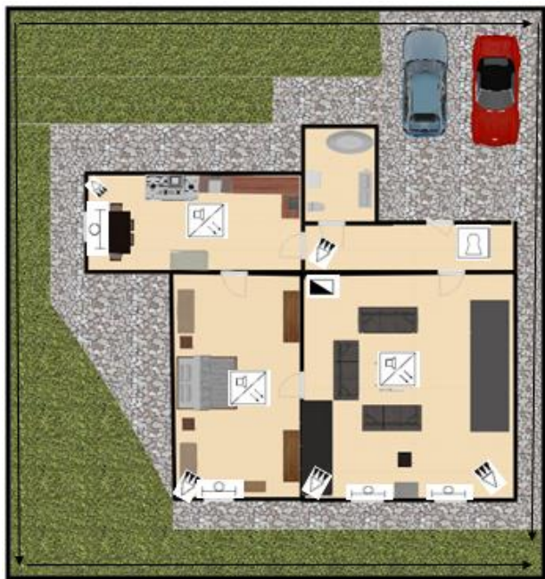
Fig.2 Proposal of measures.

The electromagnetic detectors also include infrared barriers, microwave detectors, radio barriers and detectors, capacitive detectors and laser detectors. [2,3]