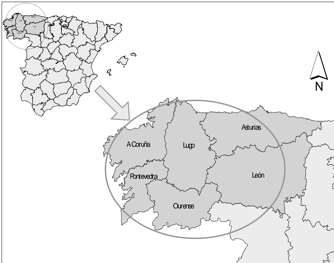
Figure 1. Location of the sampling plots in the study area within the Iberian Peninsula.