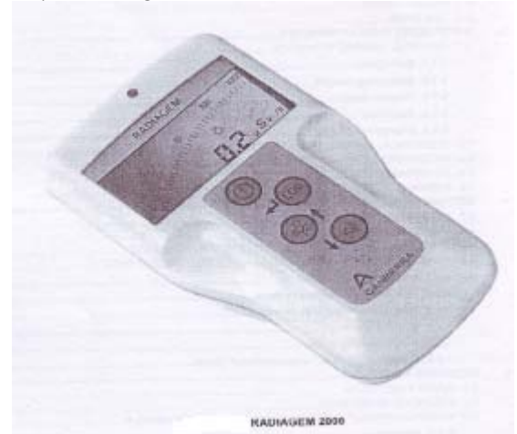
Fig. 2: (RADIAGEM 2000)

Probes) SG-IR is designed for gamma radiation measurements. SG-IR which is a gamma probe with NaI(Tl) 1"×1" detector, is not energy independent, but it measures dose-rate equivalent. It is used for medium sensitivity with a dose-rate range from 10 nSv/h to 200μSv/h (Fig. 3).