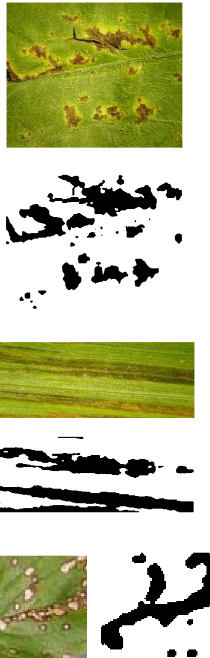
Figure 2: Plant diseases detection using Y C_b C_r color model

previous examples this recognition was the most precise. Some not infected parts are still marked as a disease, which is visible in the third test example. The first two examples were almost completely correctly marked.