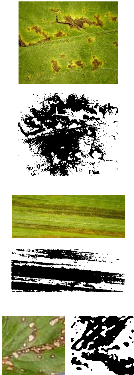
Figure 1: Plant diseases detection in RGB image