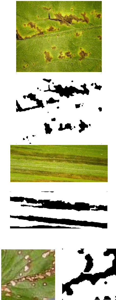
Figure 3: Plant diseases detection using HSI color model

model is used barely recognized only one. This leads to the conclusion that this color model is not appropriate for early disease detection which is one of the goals of the proposed algorithm.