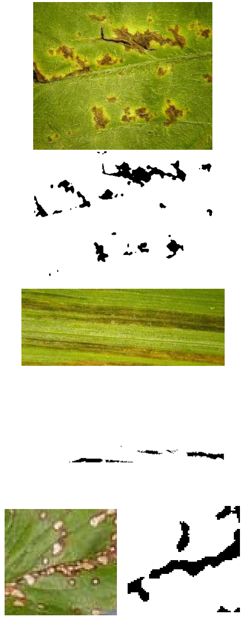
Figure 4: Plant diseases detection using CIELAB color model